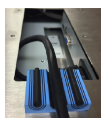
Plug cables into their respective connectors, then align the cables through the ports of rubber block. Be sure to keep black rubber cylinders in place for each unused port.