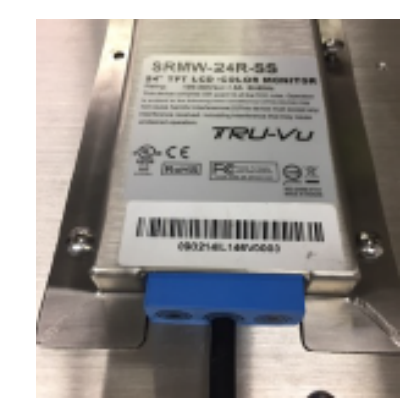
Tighten all 7 screws. The blue rubber block should not be able to move.

These procedures will ensure that your TRU-Vu monitor maintains its water-tight Integrity.