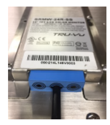
Then replace the rear cover plate. The blue rubber block should protrude slightly as shown.