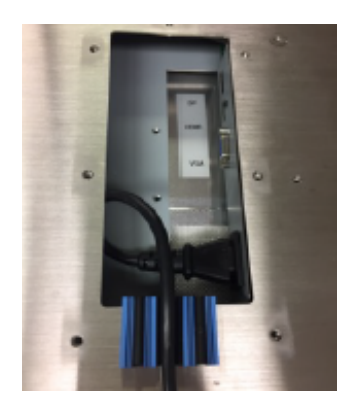
Remove the monitor's rear cover plate by removing all 7 screws.